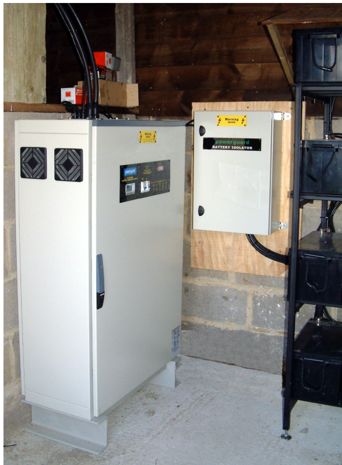
A TYPICAL INSTALLATION SHOWING THE PS SYSTEM, BATTERY ISOLATOR AND PART OF THE BATTERY BANK.

The PS System starts the generator to power the heavier loads during the day and when it is running uses the surplus power to recharge the batteries. The PS System will automatically adjust the battery charge rate to suit the load on the generator. If the load increases the system will reduce the charge